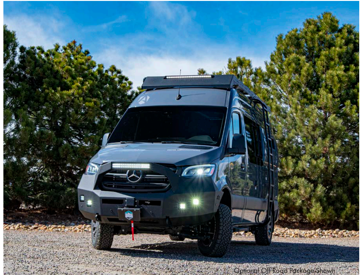
Optional Off Road Package Shown

The Mercedes chassis delivers extra power and unrivaled quality, allowing you to make the most of every moment both on and off the road.