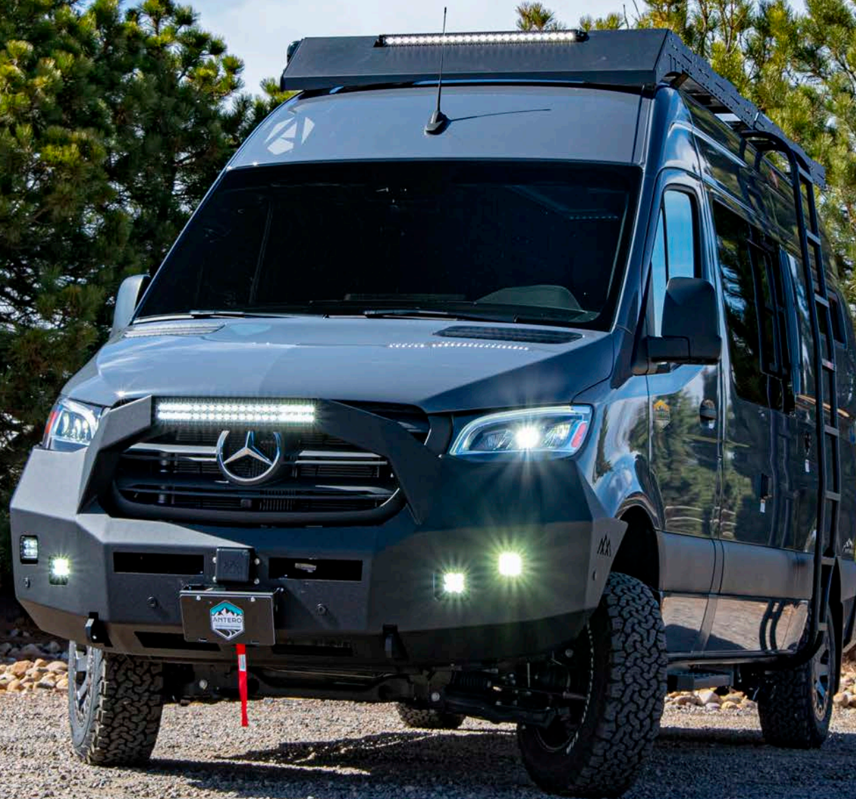
Optional Off Road Package Shown