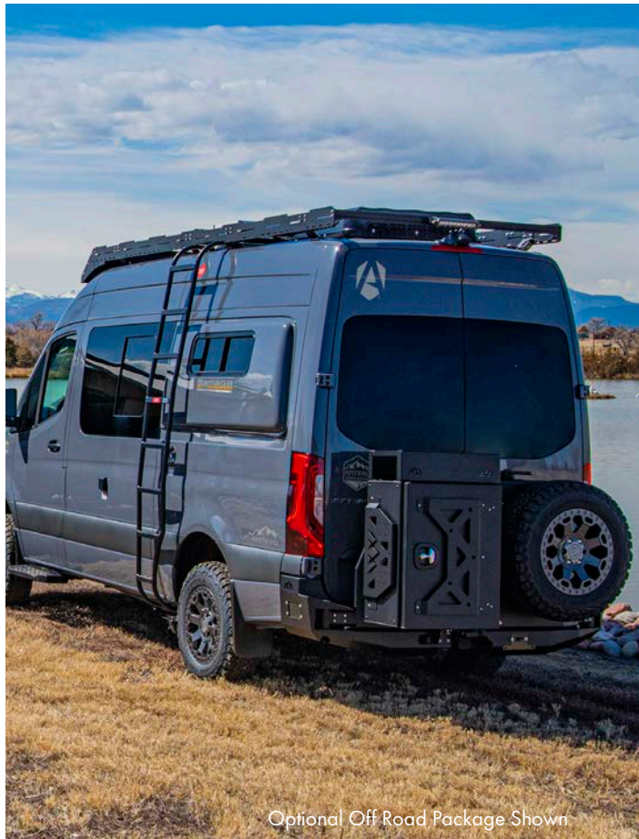
Optional Off Road Package Shown